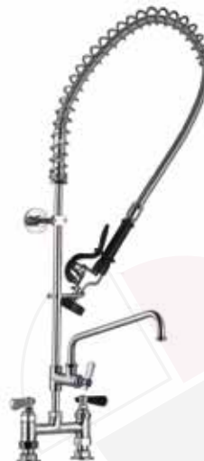
pre-rinse unit with bridge tap with swivel tap