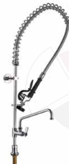
pre-rinse unit without fitting with swivel tap