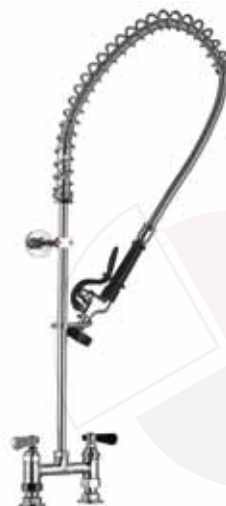
pre-rinse unit with bridge tap without swivel tap